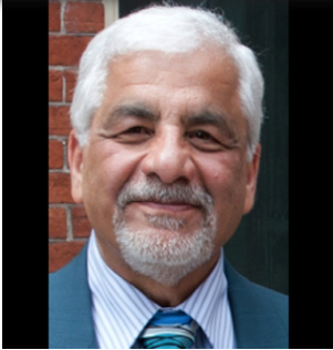
IEEE CTS Chairman